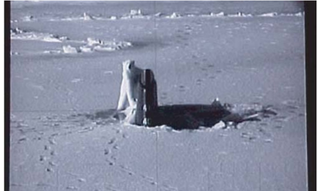
Getting a Leg Up on the Situation

The recent Iraqi war brought mine warfare back into the spotlight of mainstream media. The southern Iraqi port of Umm Qasar was a key staging area for sea-borne supplies. The British ship Sir Galahad, laden with 232 tons of supplies, was forced to remain offshore when mines were detected in Umm Qasar’s harbor. A relatively new AUV named “REMUS” was used as part of mine