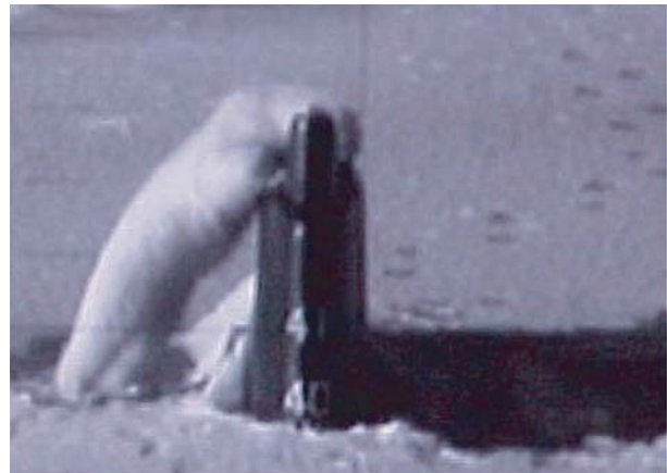
Sampling the Goods

clearing operations. Prior to the onset of hostilities, National Public Radio (NPR) in the United States featured an overview of mine warfare technology, covering mammal-assisted mine counter-measure techniques through autonomous systems. The web link for NPR’s story is http://www.npr.org/display_pages/features/feature_943641.html