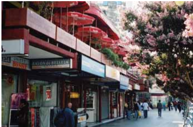
Restaurants in Vina Del Mar