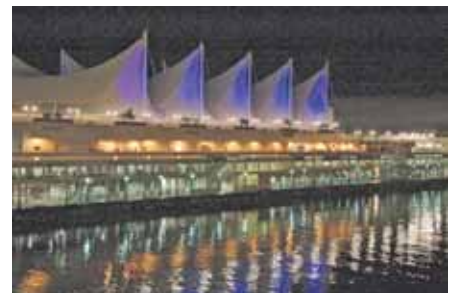
Canada Place, Vancouver Convention and Exhibition Center