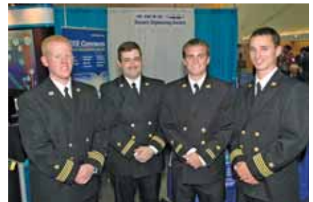
Massachusetts Maritime Academy Cadets