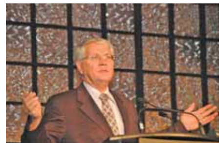
Honorable Richard Neufeld, Minister of Energy, Mines and Petroleum Resources