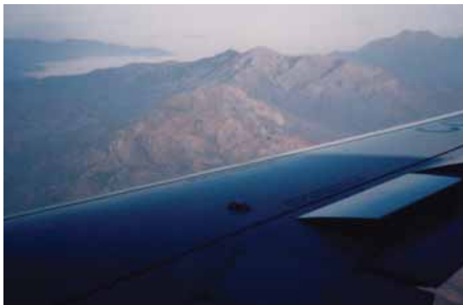
Crossing over the Andes—Santiago to Buenos Aires