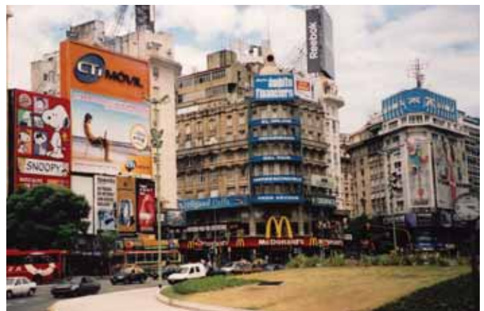
9th of July Avenue—Widest in the world