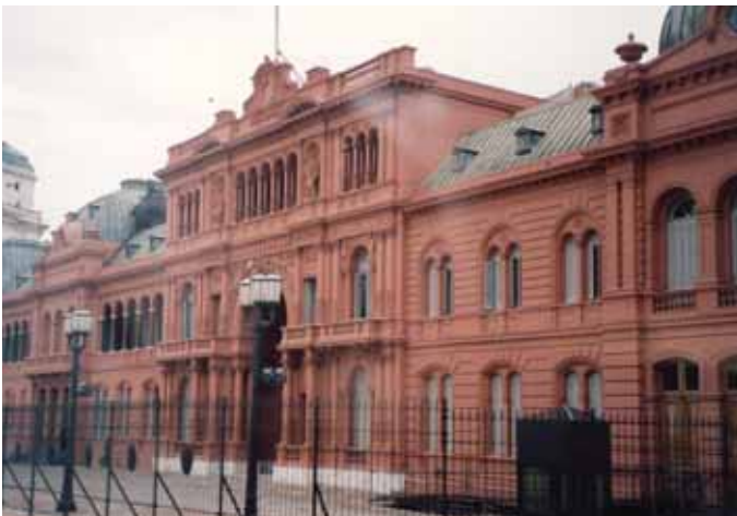
Casa Rosada (Pink House) Government Building. Made famous by Eva Peron