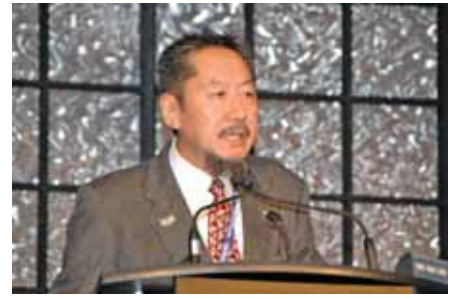
Tamaki Ura_IEEE Fellow