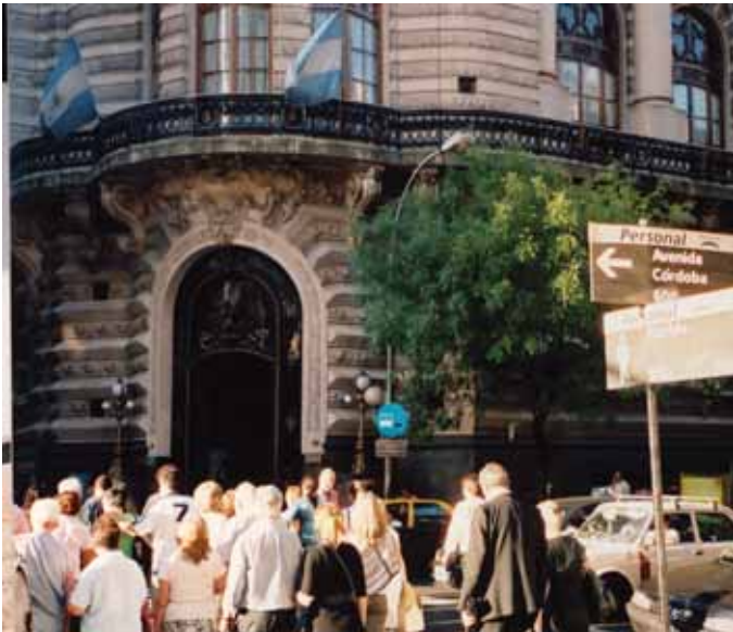
Naval Building at Cordoba & Florida---The heart of Buenos Aires Activity