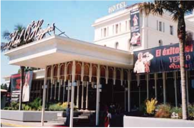
Hotel O'Higgins nearby