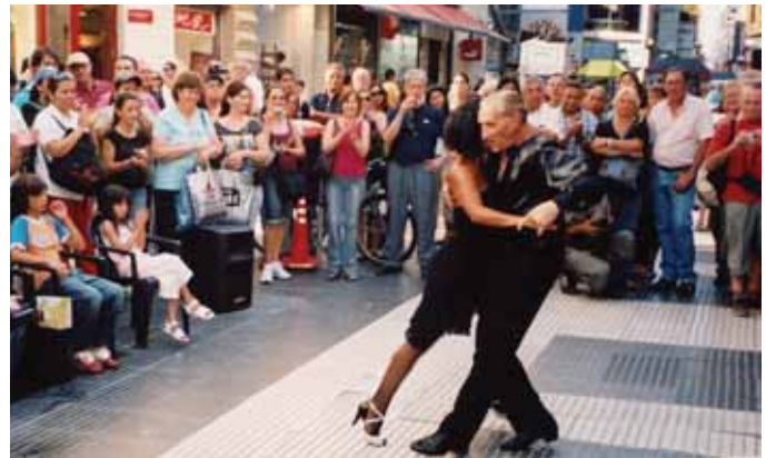
Tango on Florida Ave., a long shopping street closed to traffic.