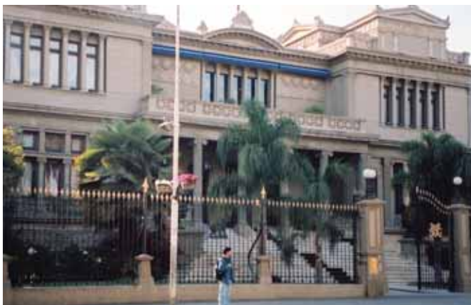
Club Vina Del Mar Workshop Site