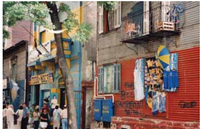
Old Boca Section artist's quarter